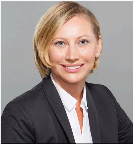
PPPs to combat Covid-19, by Natalia Korchakova-Heeb

Covid-19 pandemic needs to be addressed through all available means. Governments need urgently to close the gap in delivery of healthcare services and healthcare infrastructure. PPPs can play a major role in these regards. Businesses, NGO and academia can collaborate to develop PPPs that go beyond infrastructure, and include also service delivery, project delivery and product development. Here are some examples: