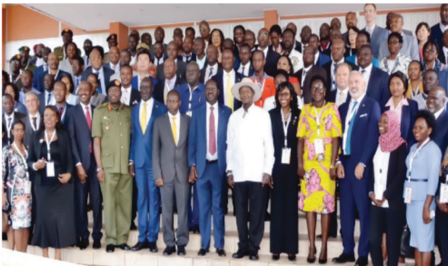
Uganda, High level inaugural PPP conference, 16-18 September 2019