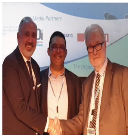
Kazakhstan, PPP and ESG Forum 30 Oct-1 Nov 2019