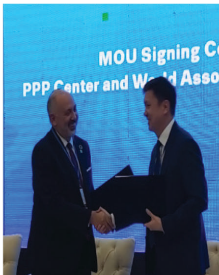
Kazakhstan, PPP and ESG Forum 30 Oct-1 Nov 2019